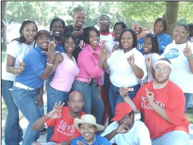
EB members pose with Greek Sororities

The Kappas had a very successful Kappa Week 2006 held on April 17-22, 2006. Events for the week included the Kappa Community Health Fair on Monday. The fair was sponsored by Campbell University, who provided information and exhibits on diseases that primarily affect minority populations such as diabetes, hypertension, glaucoma, kidney failure, and cancer. On Tuesday, the fraternity offered free Kappa Kutz to students at FSU and a Kappa Fashion Show. Greek Sororities such as Delta Sigma Theta, Alpha Kappa Alpha and Zeta Phi Beta were featured in The Kappa Fashion Show. On Wednesday, the chapter gave away a $250 scholarship to G Psi Phi, a step team from Pine Forest High School, who were the first place winner of the Kappa Talent Show. On Thursday night, the chapter sponsored a party at the club Paladium. On Friday, the chapter sponsored a Kappa Kookout and Women Appreciation Day. Women across FSU campus were given red carnations and chocolate candy in appreciation of the things they do to make FSU a great university. Over 100 students attended the Kappa Kookout.